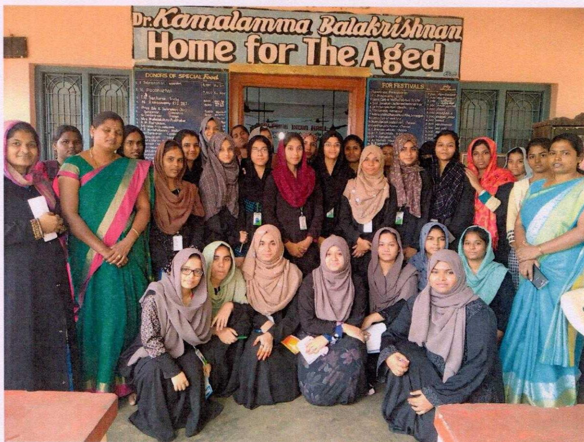
STUDENTS VISITED TO THE OLD AGE HOME