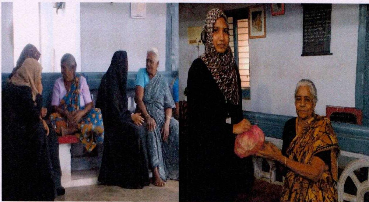
STUDENTS INTERACT WITH THEM AND GAVE THEIR TOKEN OF LOVE